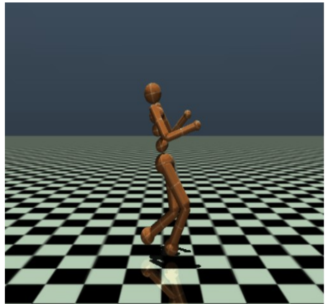
Fig. 1. Gymnasium in action [2]

As seen in Fig. 1. one such body in its training environment struggles with Gravity.