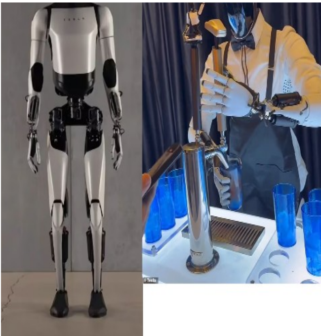
Fig. 3. Optimus robot [4][5]

According to official statement during a certain tech demo in California, a robot in many ways similar in size to our sparring robot is soon to be sold for 20 000$ and has 10 000$ cost of production. That is of course information about the Optimus by Tesla as shown in Fig. 3.