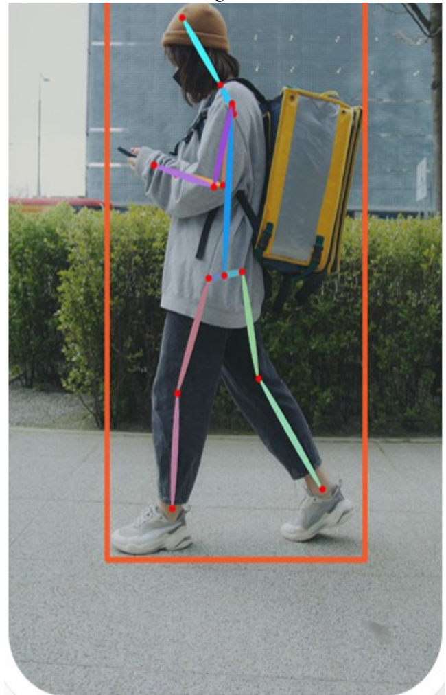
Fig. 2. Machine vision recognizing human and its limbs

opponent. The robot being technically blind in regards to the training environment will have to know the positions and rotations of its body parts as well as those of its opponent. And here is the trick in delivering this to the real world. A computer vision method can be added to the robot in the real world for it to be able to recognize the opponent in real time. Such a method is shown in Fig. 2.